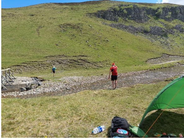
CP 4 Location at the Linn of Avon