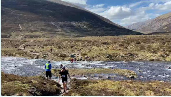
Cross the river at the Fords of Avon...