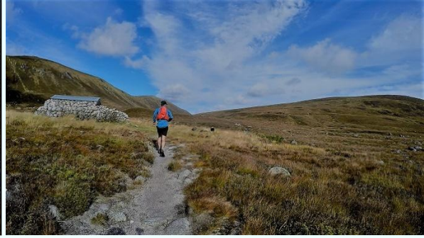
Then turn Right at the Shelter at CP2