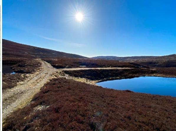
CP 5 Location

Course GPS Measurement: Recorded with Suunto Ambit Peak. We try to ensure that we measure the courses as accurately as possible using several different recording devices & various recording settings. Please note that the actual distance and elevation gain can vary between +/- 5 % depending on the measurement method, i.e., make & model of watch/GPS unit, unit settings, tree cover, etc.